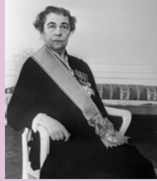
IMAGE: The first ever woman ambassador, Alexandra Kollontai with the Norwegian St Olaf order.

As a member of the revolutionary government Kollontai was able to implement the reforms she had long advocated. She was best known for founding the 'Women's Department', an organization that worked to improve the conditions of women's lives in the Soviet Union, fighting illiteracy and educating women about the new marriage, education, and working laws brought about by the Revolution. However, Kollontai became increasingly critical of the Communist Party and eventually lost political influence. She was appointed to various diplomatic positions from the 1920s, preventing her from influencing policy related to women at home.