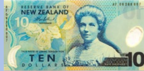
IMAGE: New Zealand 10 Dollar Bank Note featuring Kate Sheppard

LEARN MORE ABOUT nineteenth-century social problems and their remedies, see Open University module A105: Voices, Texts and Material Culture .