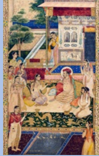
IMAGE: Empress Nur Jahan with Emperor Jahangir and Prince Khurram, c.1624–1625.

LEARN MORE ABOUT gender and empire, see Open University module A326: Empire: 1492–1975 .