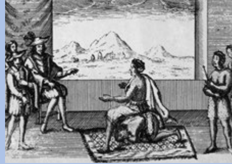
IMAGE: Engraving showing Queen Nzinga of Matamba sitting on a kneeling man to receive a group of Portuguese, c.1626.

Visit www.open.edu/openlearn/worldchangingwomen