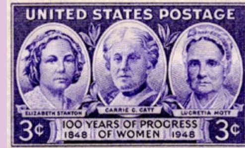
IMAGE: United States postage stamp featuring Lucretia Mott

Visit www.open.edu/openlearn/worldchangingwomen